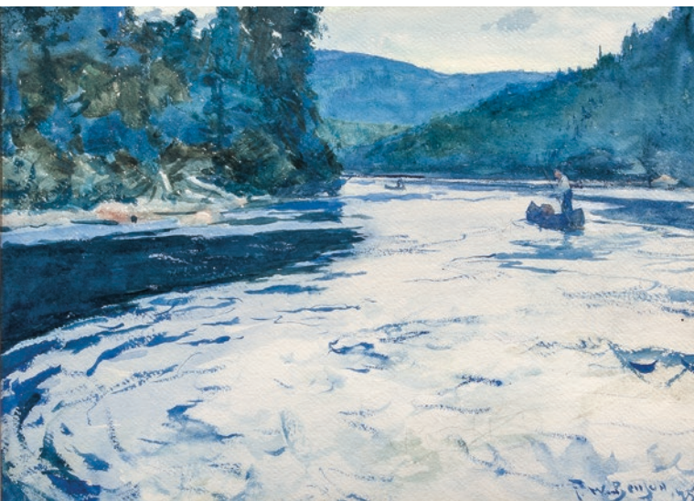
Frank W. Benson (1862-1951), Salmon Fishing , 1925. Watercolor, 14 x 19½ in. Estimate: $25/35,000

Copley’s Sporting Sale begins at 11 a.m. Friday, July 25, for decoys and Saturday, July 26, for paintings and works on paper. ■