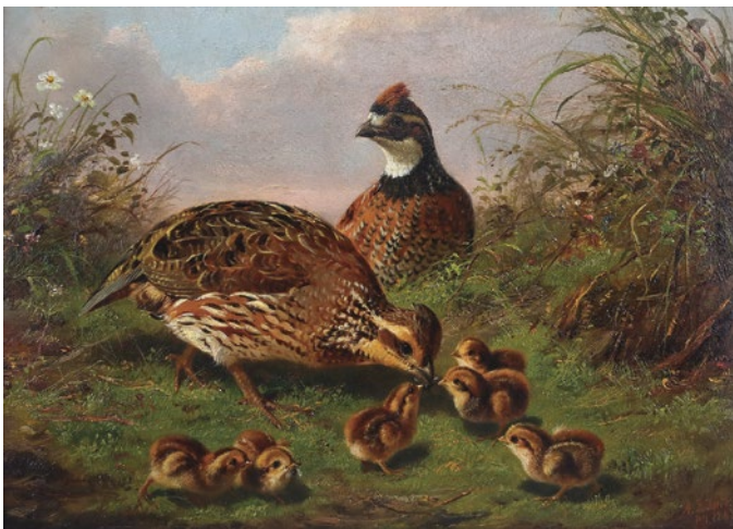
Arthur Fitzwilliam Tait (1819-1905), Quail and Chicks , oil on board, 10 x 14" Estimate: $20/30,000