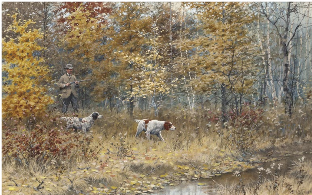
Arthur Burdett Frost (1851-1928), Autumn Woodcock , gouache, 13½ x 21" Estimate: $70/90,000